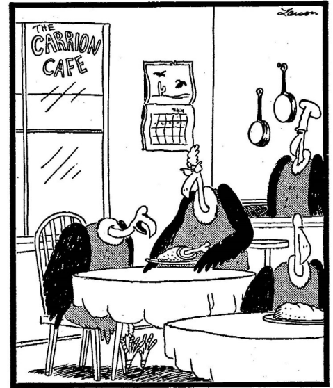
"Saaaaaay ... this doesn't look spoiled."