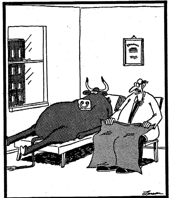
"Now relax. ... Just like last week, I'm going to hold the cape up for the count of 10. ... When you start getting angry, I'll put it down."

Most Wanted? Another mugshot to be on the lookout for. She was arrested for being a stripper in Houston. I don't get it, who would want to see her without clothes?