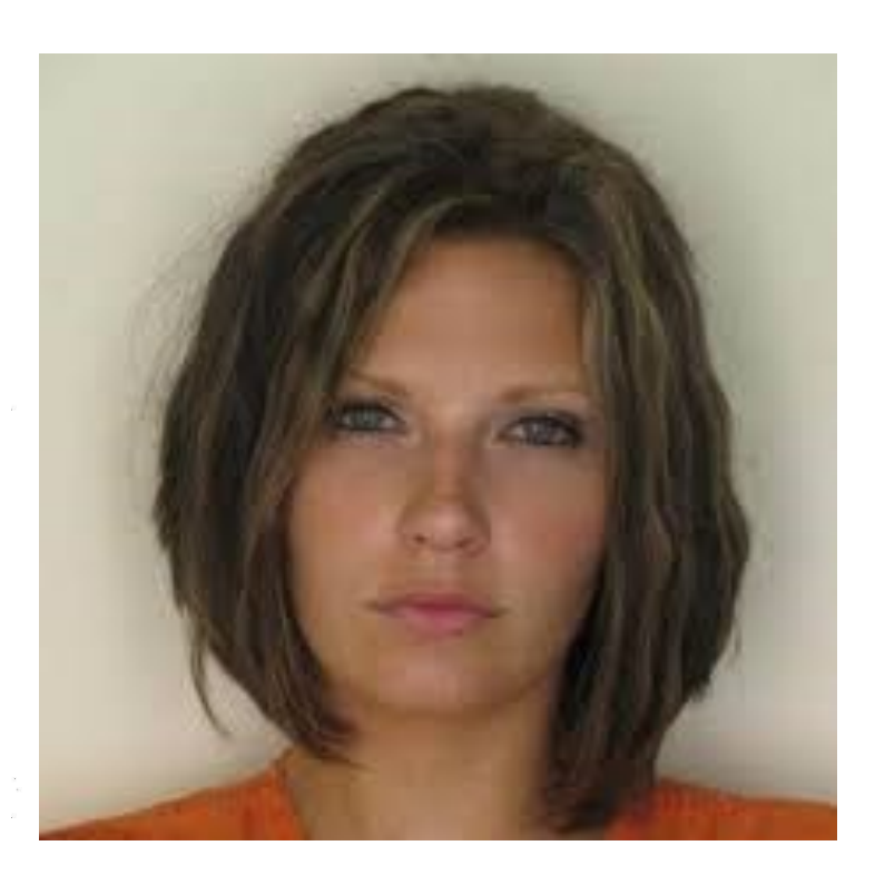
This is a real mugshot. Looks like trouble. . . . I wonder when she gets out?