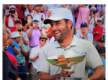
A $25MM smile!