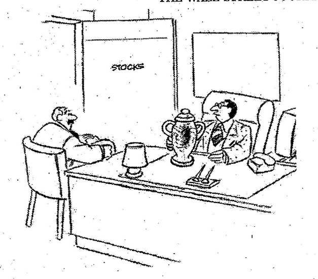
"Where would you like us to scatter the remains of your portfolio?"