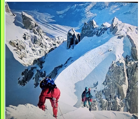
Proposed new activity for Branch 49. . . . Who's in?

We will have our usual cornhole "Cornament"