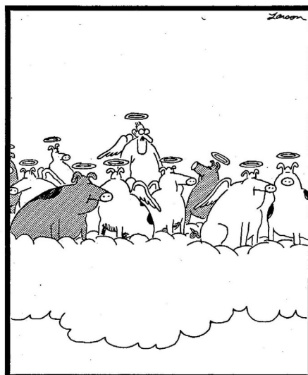
Through some unfortunate celestial error, Ernie is sent to Hog Heaven.